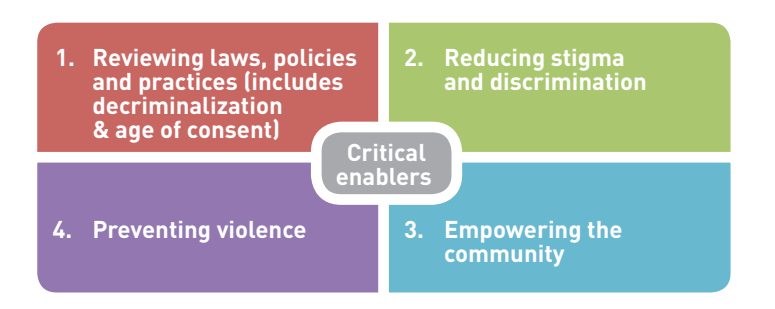
Fig. 5.1 Critical enablers for key populations

This chapter outlines a range of barriers that compromise access to appropriate and good-quality HIV services for key populations, identifies critical enablers to overcome these barriers (as illustrated in Fig. 5.1) and makes a number of goodpractice recommendations. These good practice recommendations are based on earlier WHO documents addressing key populations. While these barriers and enablers are interrelated, we attempt to discuss each individually.