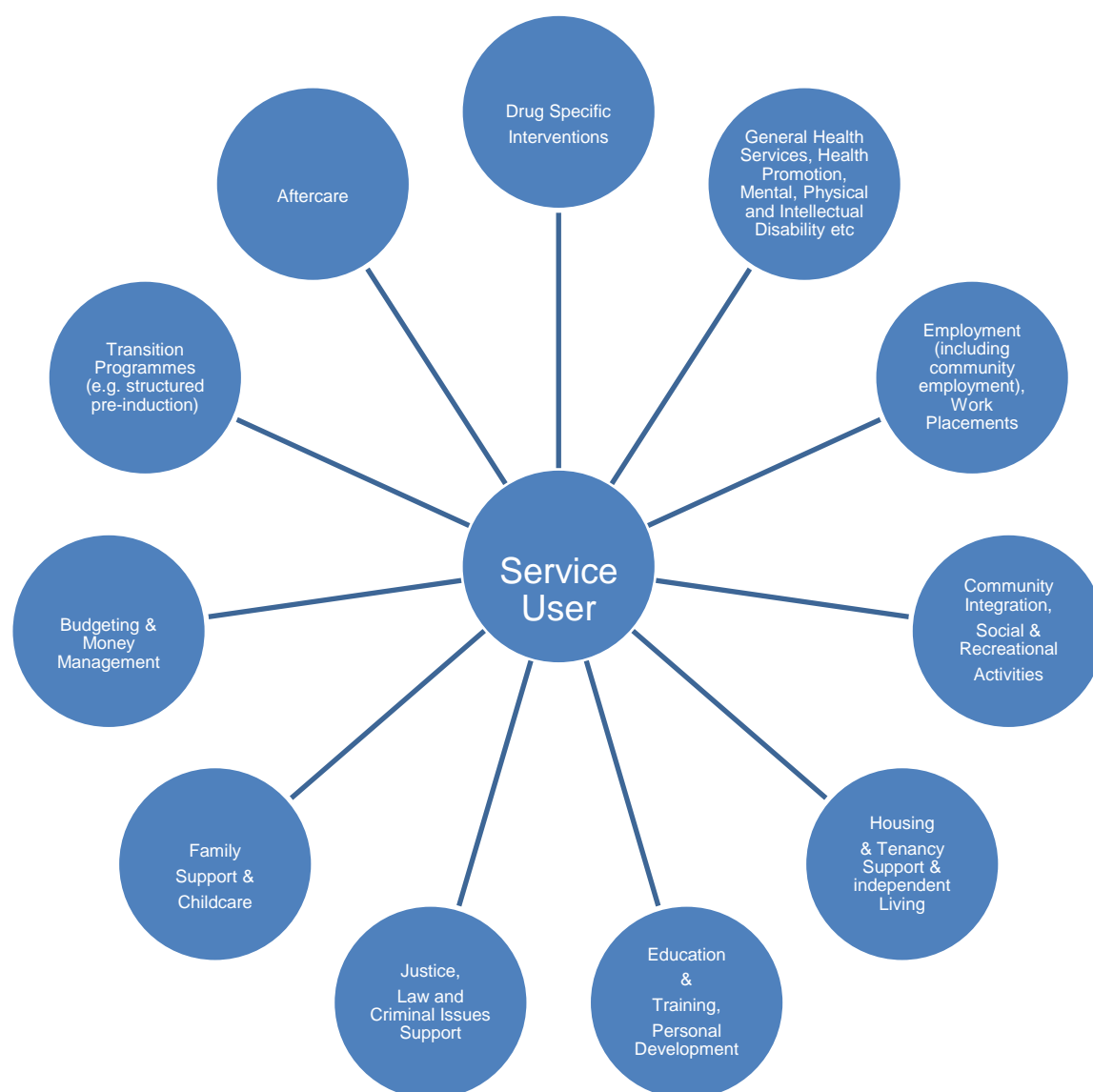
Figure 1: The range of supports required for an effective, integrated model of rehabilitation

The NDRIC recognise that an integrated model of rehabilitation supports requires a wide range of components. Depending on complexity of need a service user may require support in one, some or all of the following areas (Figure 1). These supports are provided by a range of statutory, voluntary and community service providers.